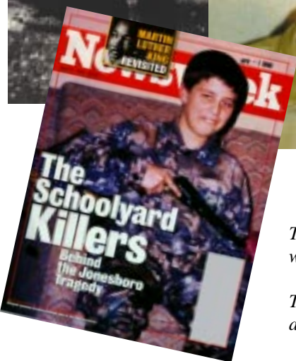
The Kids in the Jonesboro killings had adult directors: - - Satan cult worshippers!