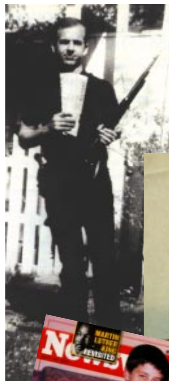
Lee Harvey Oswald had Clay Shaw as his CIA handler.